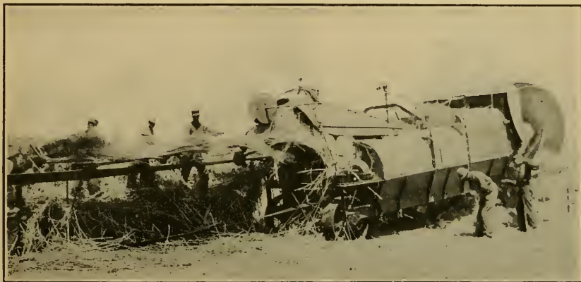
FIG. 1.—Hemp-breaking machine. The stalks are fed sidewise in a continuous layer 2 to 3 inches thick, turning out about 4,000 pounds of clean fiber per day and five times as much hurds.

The yield of hemp fiber varies from 400 to 2,500 pounds per acre, averaging 1,000 pounds under favorable conditions. The weight of